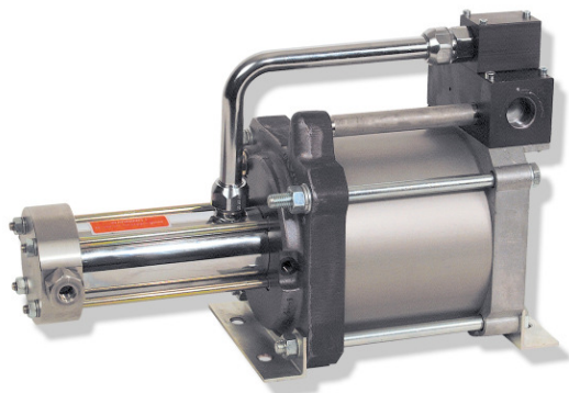
DLE 5-1 single acting, single air drive head single stage